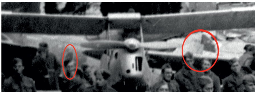
Photo made at the apron of Zemun aerodrome in March 1945. Seen behind are a de Havilland DH.60III Moth Major and Fw 190 F-8 with typical German style „black 1" and Yugoslav tricolor with red star on the rudder.